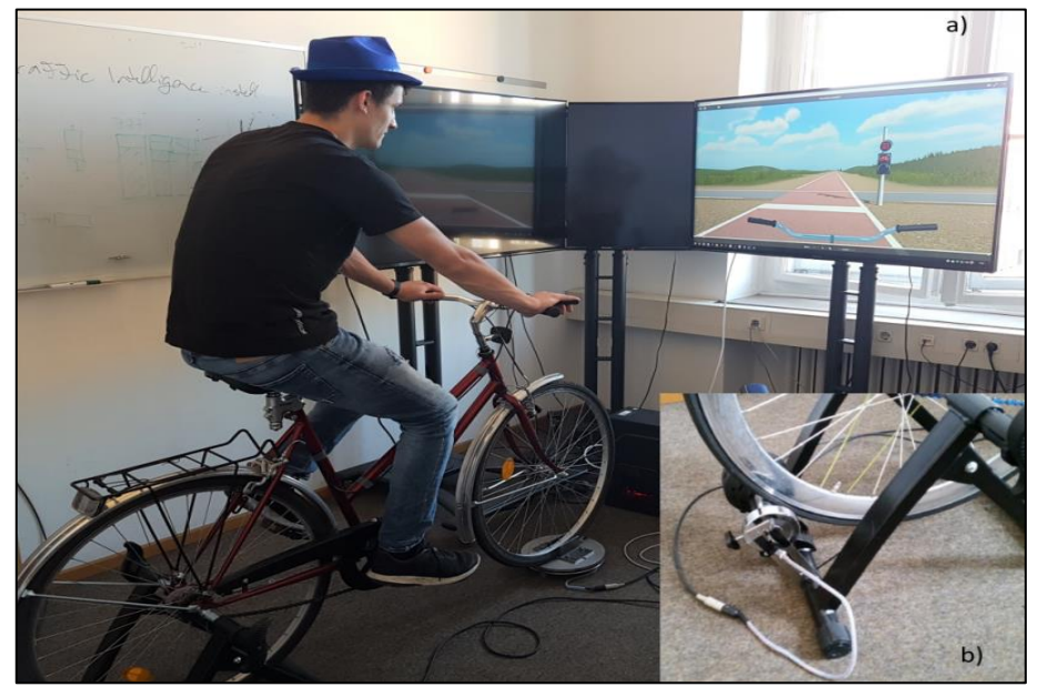
Figure 2: Bicycle simulator (a) and detail of the rear wheel fixed on a bicycle trainer (b).

Countdown timers are devices that indicate the remaining red or green phase time durations of traffic lights. Different designs have evolved over the years for indication of the time left before the next phase change. In most cases, numbers are displayed counting down the remaining seconds to zero. Another design option is an elapsing circle of LED lights. Bicycle countdown timers can help reducing red light violations [WIERSMA, 2006]. Satisfaction surveys indicate that presence of a countdown timer makes waiting at an intersection more comfortable. Furthermore, 70 % of respondents believe that they improve bicycle traffic safety [LAMBERS, M.G.F, 2009, QUOTED IN AKKERMAN, 2010]. In Germany, countdown timers for bicyclists are not implemented yet. A bicycle simulator study was conducted win the scope of this Master's Thesis to test the effect of countdown timers on traffic safety and efficiency. Furthermore, two different designs of countdown timers (presented in Figure 1) are tested and evaluated within a survey conducted with the test participants after the simulator experiment.