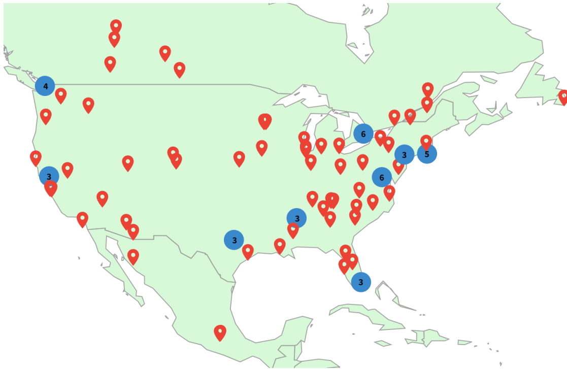
WoS Geographic Citation Map- North America zoon